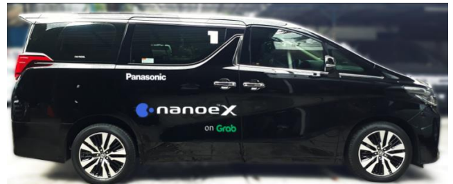
Grab’s Premium vehicle for ‘Magic Air Invitation’ equipped with nanoe™ X generator