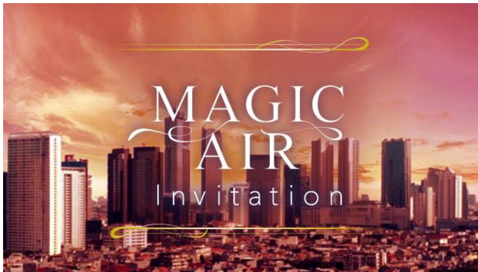
‘Magic Air Invitation’ campaign image

Jakarta, 21 January 2021 – PT. PanaHome Deltamas Indonesia (which part of Panasonic Group), presents “Magic Air Invitation” campaign from 23 January to 14 March 2021. This sets to invite customers on a car ride equipped with Panasonic’s nanoe™ X generator, to experience clean, healthy and comfortable ventilation within the vehicle. Panasonic’s nanoe™ X technology with the benefits of hydroxyl radicals contained in water is proven effective in inhibiting the growth of bacteria, viruses, fungi, allergens, pollen and harmful materials (PM2.5). It helps to deodorize the air and moisturizes the skin and hair and has broad applications from appliances such as air conditioners, air purifiers to enclosed spaces that require a high degree of safety and comfort. Customers will be transported by a Grab vehicle installed with nanoe™ X generator to SAVASA; a smart-township development with housing units powered by Panasonic.